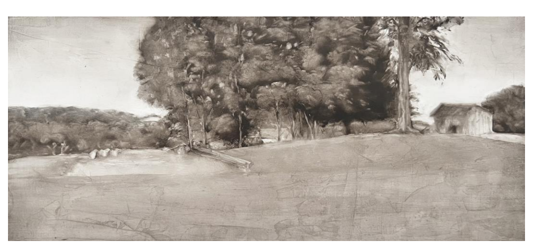
Lynne McDaniel, Souvenir 3 (Morning view), Oil on canvas, 7 x 15"

LAUNCH Gallery 170 S. La Brea Ave. Los Angeles, CA 90036